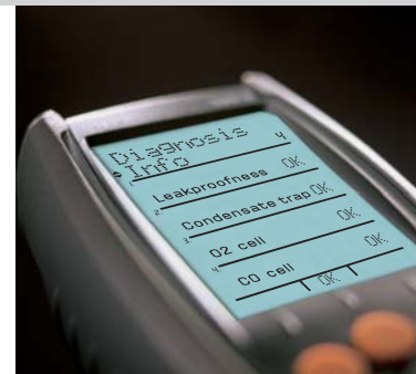
Always safe: thanks to the diagnosis and display of the condition of the wearing parts