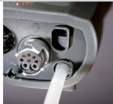
Additional \Delta P measurement up to 200 mbar